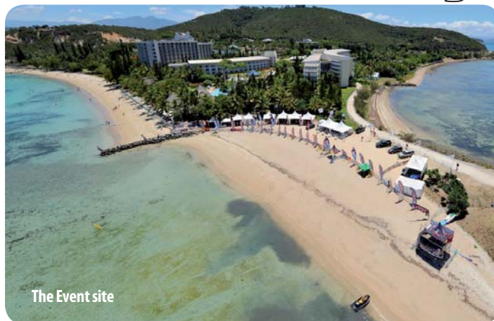
The Event site

Now I'm back to France for 2 weeks, to see my family, before I fly back to New Caledonia for the winter time.