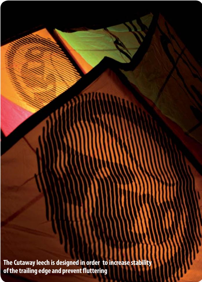
The Cutaway leech is designed in order to increase stability of the trailing edge and prevent fluttering