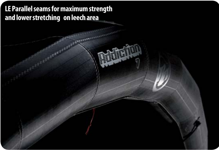
LE Parallel seams for maximum strength and lower stretching on leech area